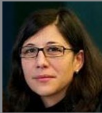
Sophie Kwasny Head of Data Protection Unit, Council of Europe, Strasbourg