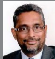
RAGUNATH KESAVAN Commissioner, Malaysia Competition Law Commission